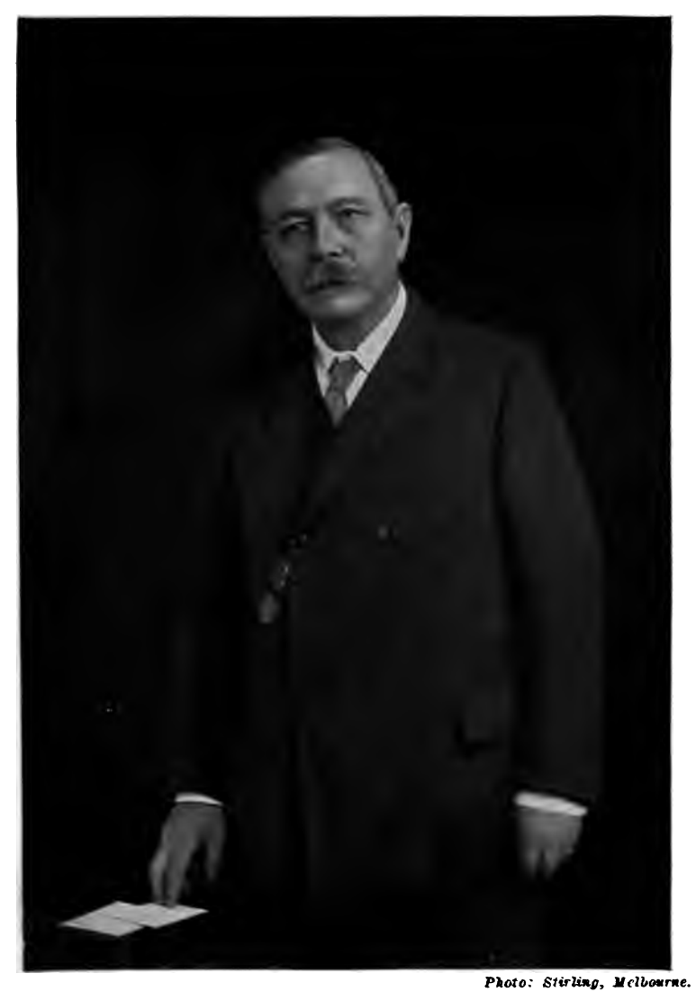
ON THE WARPATH IN AUSTRALIA, 1920-21.